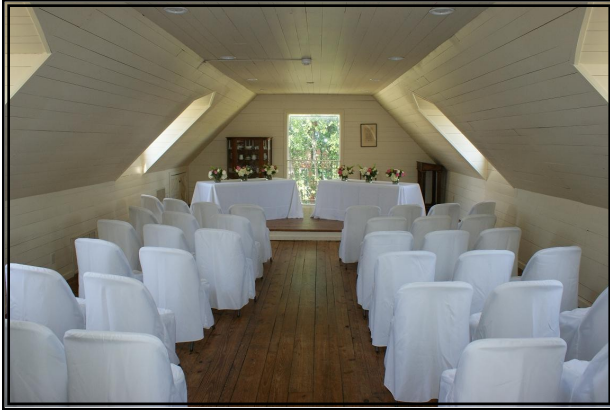
INTERIOR OF CARRIAGE HOUSE LOFT SUITABLE FOR UP TO 35 GUESTS

THE CARRIAGE HOUSE LOFT IS ALSO AVAILABLE FOR SMALL WEDDINGS AND SHOWERS.